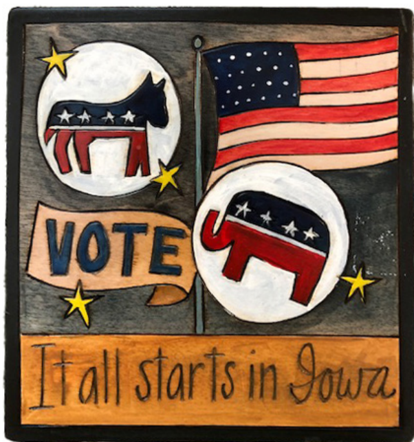
Sticks sign image courtesy of Carol Grant