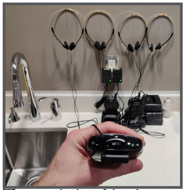
Theater behind back row

To use hearing assistance devices in theater and community room, no adjustments need to be made on the main equipment rack. The hearing loop system is always on. To use it, turn the dial on the top of one of the hearing assist devices. You will feel it click once it is moved from the "Off" position. Now, adjust the dial to your preferred volume. Please return dial to "Off" position when finished.