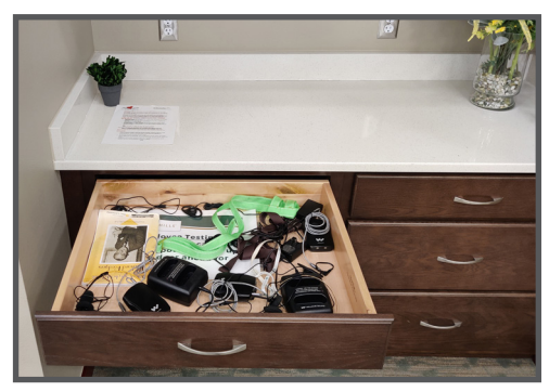
Community Room drawer

Those that have hearing aids that are Tele-Coil capable will not need headphones. However, most people's hearing aids do not have that feature (at least from my understanding). I think more people are upgrading to them over time, but I know there are a lot of people here that do not have that capability.