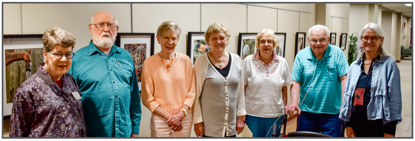
The Art Gallery Committee

Again, residents' collections (photography and art works) will be featured following an agricultural/rural theme: images of old farmsteads and machinery, rural architecture, and farm life are the kinds of things we're curating. Submissions are not limited to Iowa visuals. If you have a treasure to share, call a member of the art committee for a consultation.