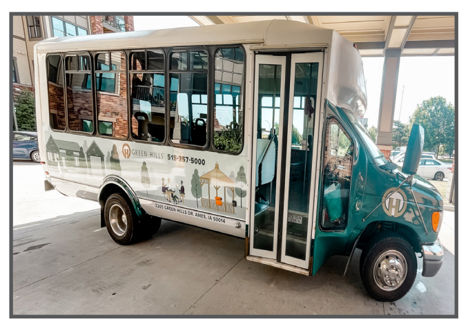
Passenger Door Side