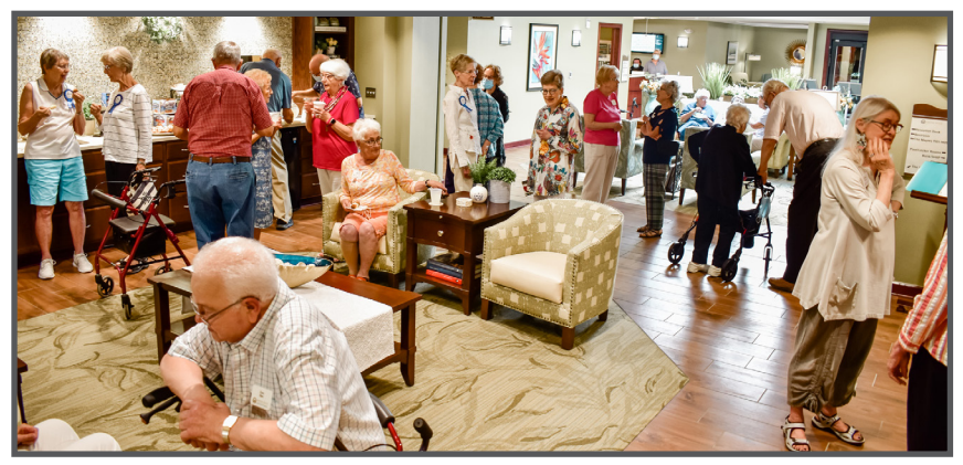
Residents & visitors socialize in the lobby