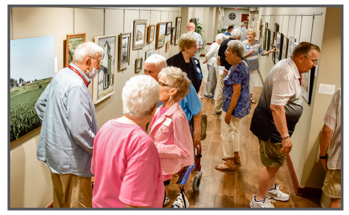
Exhibitors share stories about their show pieces